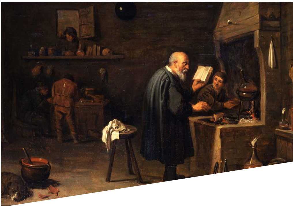
The Bald-Headed Alchemist , 1600s After David Teniers II, Flemish School Oil on panel Gift of Fisher Scientific International

This humble but busy workshop shows an alchemist at work before a furnace. He is stirring the contents of his crucible while reading a small book: he may be following a recipe, or glancing at his own notebook to remember an important detail. His young apprentice stands by, attentively looking for guidance, and in the background are two other assistants, working at a lab bench. On the left is a small dog (sometimes a symbol of loyalty or diligence) lying near a large earthenware pot and several broken pot shards. These clay vessels may have broken from thermal shock when they were heated or cooled too quickly. They remind us that alchemical processes can be messy and difficult.