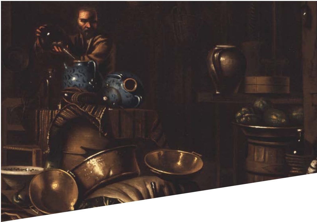
Alchemist Filling Wet Drug Jars , 1600s-1700s Anonymous, Dutch School in Italy Oil on canvas Gift of Fisher Scientific International

There's a reason we sometimes think of salads as "summer" foods: lettuce and leafy greens were once believed to have a powerful cooling effect on the body. Lettuces were prescribed for people suffering from fevers, but also for those who experienced insomnia, since it was believed that excess internal heat kept you from falling asleep. In this apothecary's workshop a man pours distilled liquid from a jar into blue earthenware vessels. His piled-up materials and tools make for a fascinating still-life subject, and the artist of this painting was clearly eager to show off their talent for rendering different types of surfaces. Look at the way each different texture of copper, clay, glaze, straw, wood, and leaves has been carefully and distinctly painted.